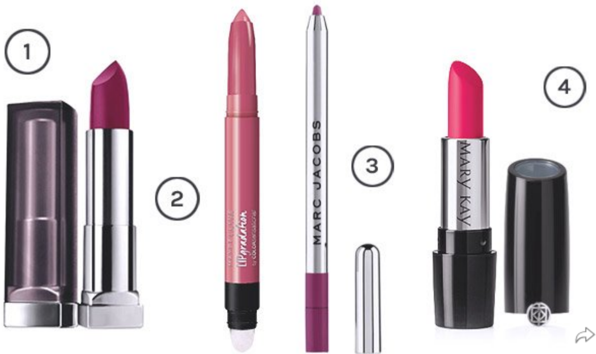
IMAGE Maybelline, Marc Jacobs, Mary Kay

good contrast and immediately brighten it