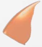
Undereye Corrector Light Peach