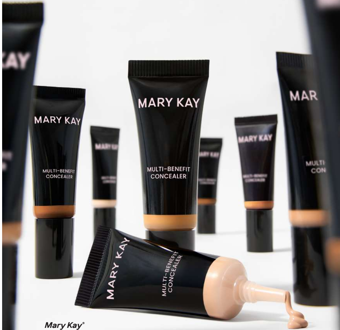
Mary Kay® Multi-Benefit Concealer, P800, 8.0g