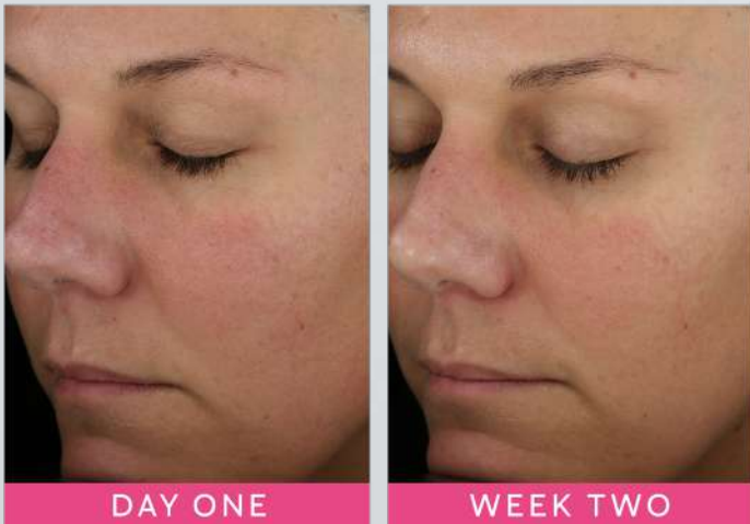
DAY ONE Weakened Before