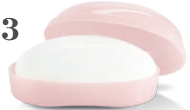
TimeWise® 3-in-1 Cleansing Bar P1,229 P699