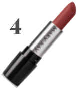
Mary Kay® Gel Semi-Matte Lipstick P599