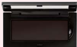
Mary Kay Petite Palette (unfilled), P299

Build your own palette based on the shades that you love and look best on you. No more shades put to waste!