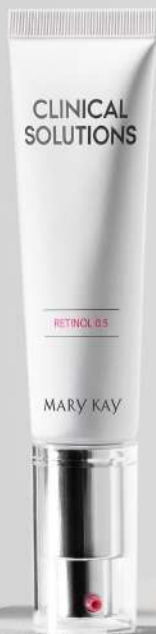
Mary Kay Clinical Solutions™ Retinol 0.5 Php4,500, 29 ml