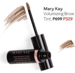
Mary Kay Volumizing Brow Tint, P699 P329