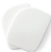
Mary Kay Cosmetic Sponge pk/2 P130