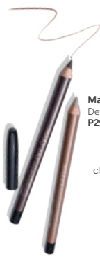
Mary Kay Brow Definer Pencil, P299