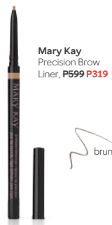
Mary Kay Precision Brow Liner, P599 P319

Accentuate your eyes with these products and see the difference.