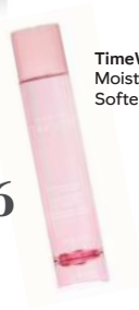
TimeWise® Moisture Renewing Softener, P1,369 P699