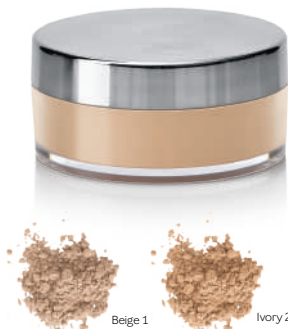
Mineral Powder Foundation, P850