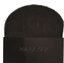
Mary Kay Palette Powder Brush, P129

Create an airbrush-like glow with the Mary Kay® Blending Sponge, P599