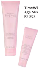
TimeWise® Age Minimize 3D Basic Set P2,898