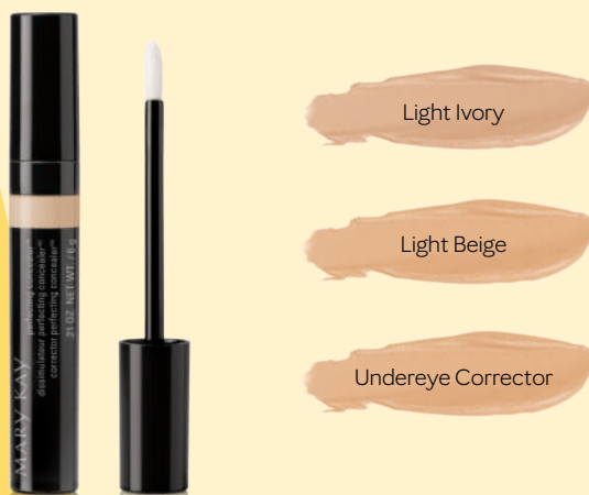
Perfecting Concealer, P549

Ask your Independent Beauty Consultant on how these products can help give your skin a beautiful and smooth finish.