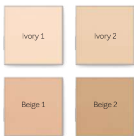
Sheer Mineral Pressed Powder, P299