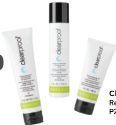
Clear Proof® Regimen Set P2,027 P1,297