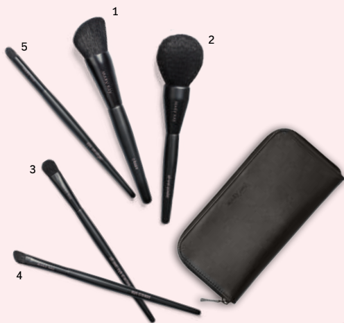
Mary Kay Essential Brush Collection, P2499

Now you don't have to worry about applying make-up with these tools that make it fun and easy!