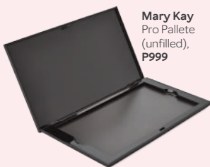
Mary Kay Pro Palette (unfilled), P999