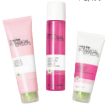
Botanical Effects Evolution™ Regimen Set P1,657 P1,227