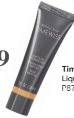
TimeWise® Matte 3D Liquid Foundation P879