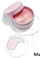
Mary Kay® Hydrogel Eye Patches P2,499