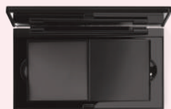
Mary Kay Perfect Palette (unfilled), P499