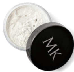
Translucent Loose Powder, P800