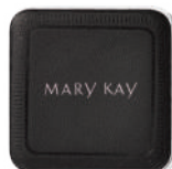
Mary Kay Powder Puff Applicator, P129