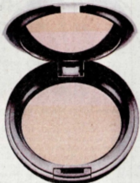
Bright ideas: Moisture White Bright Compact Foundation and Moisture White Shiso Overnight Triple Boost Serum

Where to get it: The Body Shop Moisture White collection is available at selected The Body Shop branches. All SM Advantage Card members can now earn and redeem points in all The Body Shop stores.